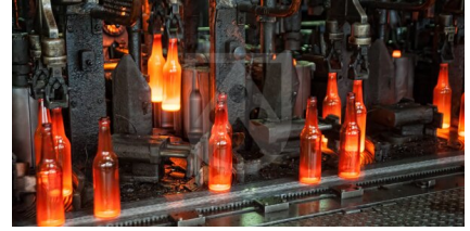
Gripper for glass bottles