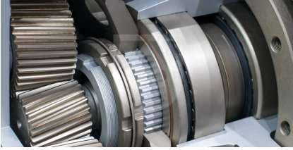
Thrust washer for electric cars